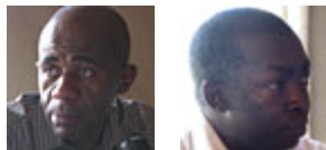
Assoumani Youssouf Mondoha MP and Said Hamid Mlatame MP

expressed strong support for the aim of moving to renewables with the utmost urgency. However, they expressed concern that the immediate introduction of immature technologies like CSP may make electricity even more expensive in places where it is already beyond the reach of most of the population. Noting the unique circumstances of small-island states, they called upon the e-Parliament to organise a series of hearings focussing on the specific needs of these nations.