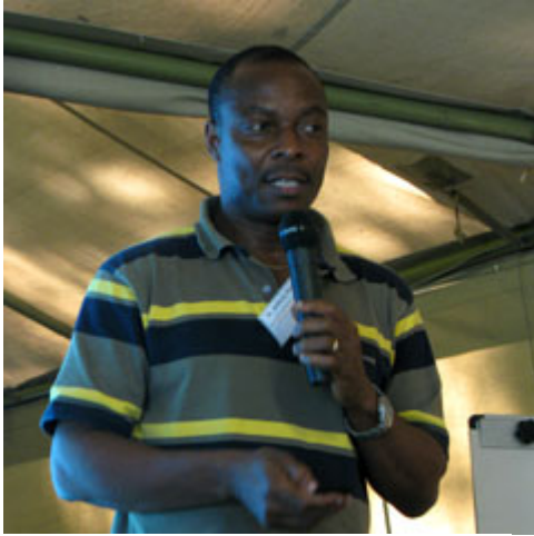
Dr Antony Nyong warned that crop yields in Africa could fall by as much as 50 percent.