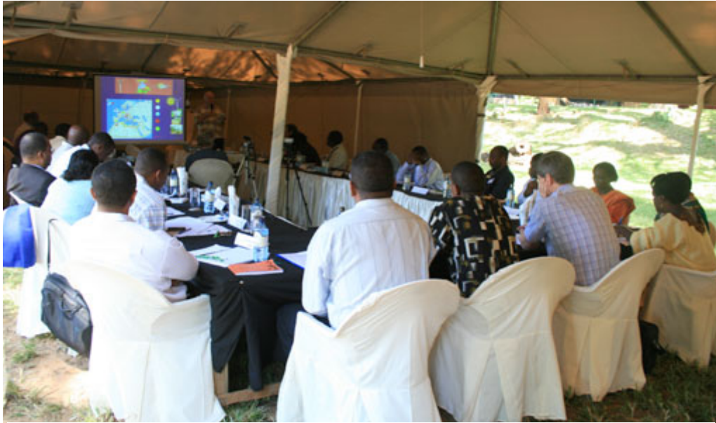
Legislators and experts listening to a presentation at Samburu.