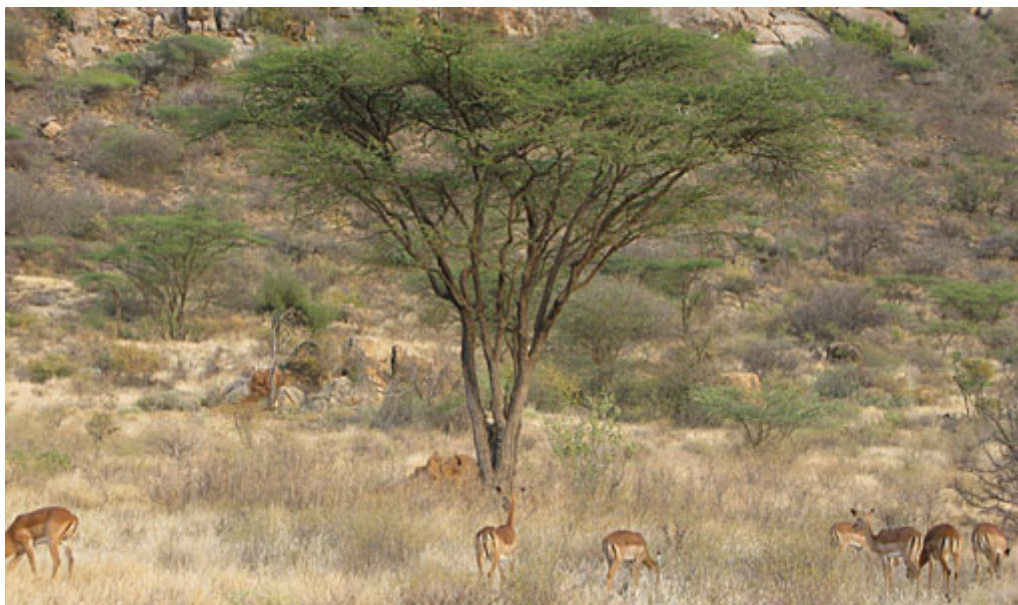
Less rain has fallen in East Africa recently making vegetation scarce for wild animals.

MPs from Kenya, Uganda, Tanzania, Ethiopia, Burundi, Rwanda, the Seychelles, Comoros and Madagascar heard presentations from a range of experts in the fields of renewable energy and rural electrification. They discovered that renewable sources could easily provide all the power that the region requires – if the political will and investment is forthcoming.