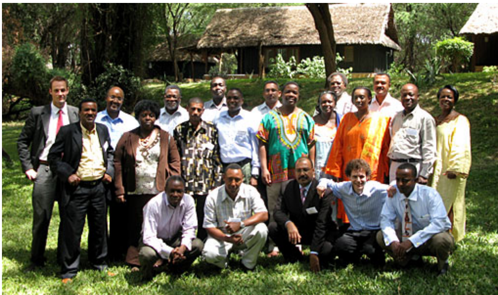
Legislators, experts and members of the e-Parliament team at Samburu.